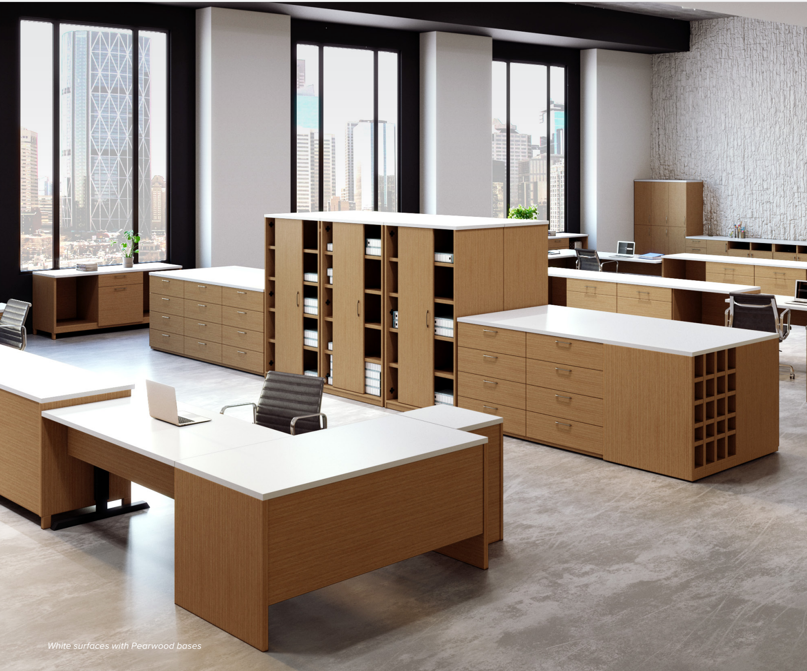
White surfaces with Pearwood bases